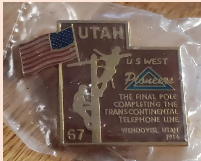
Found on ebay for $12.00 dated 1914 the final pole completing the transcontinental line and chapter "67". Hurry it may still be there.